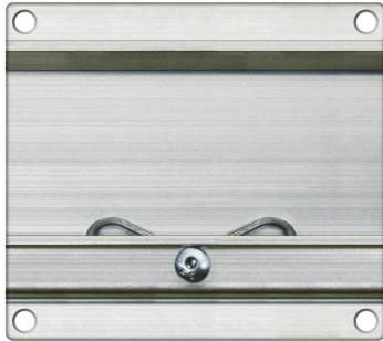
Four screw hole locations for Integra