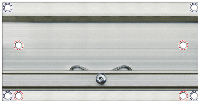
--- Four screw-hole locations for Viper and HiPR-900 --- Four screw-hole locations for Phantom II